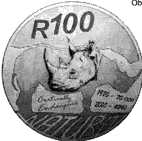
Reverse - R100 (1oz) Natura