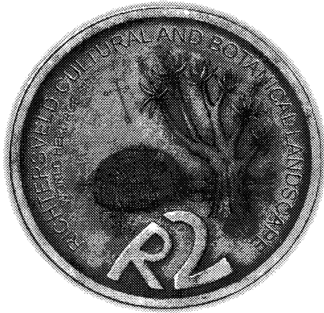
Reverse - R2 (1/4 oz) Gold Heritage Coin

WORLD HERITAGE SITE SERIES The Richtersveld Cultural and Botanical Landscape