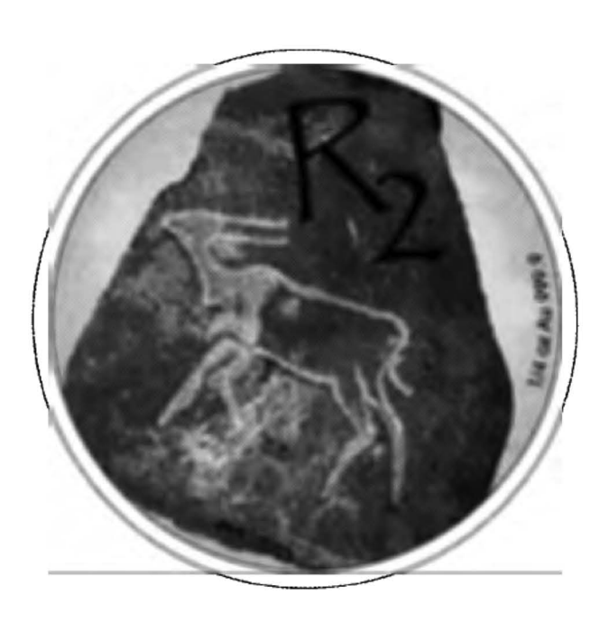
Reverse - R2 (1/4 oz) 24 ct Gold Coin