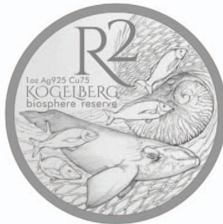
Reverse: R2 (1oz, Ag 925 Cu 75)