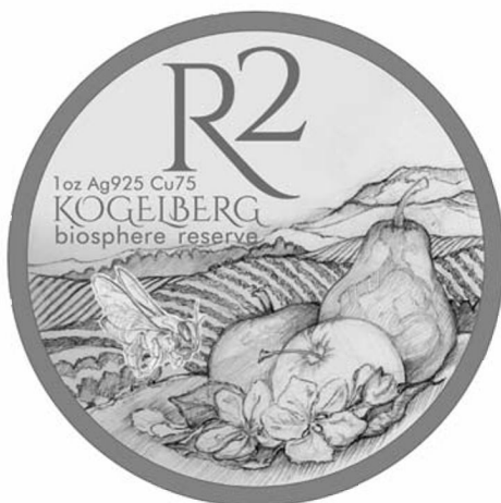
Reverse: R2 (1oz, Ag 925 Cu 75)