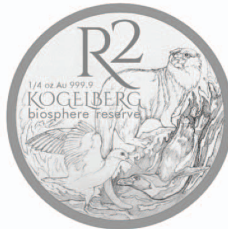
Reverse: R2 (1/4oz, Au 999.9)