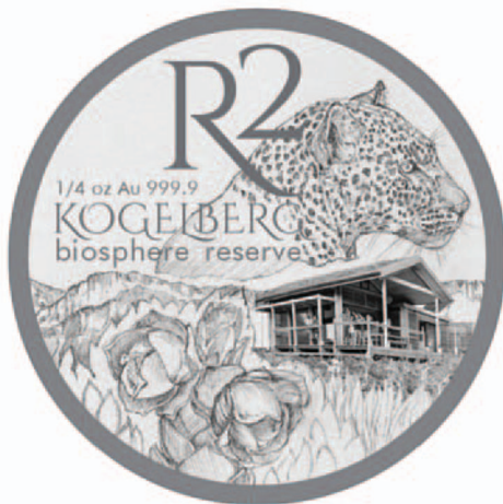
Reverse: R2 (1/4oz, Au 999.9)