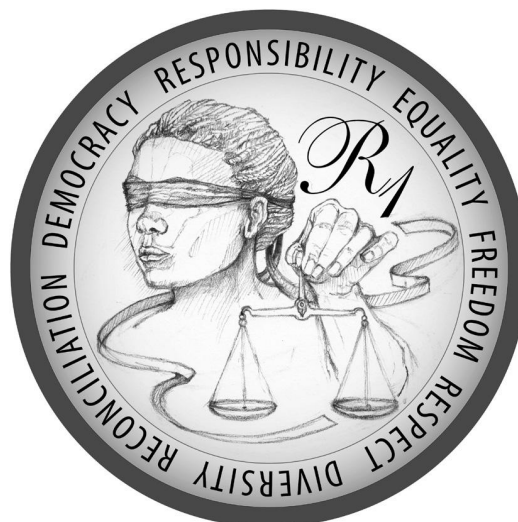
Reverse: R1 (Ag 925, Cu 75)