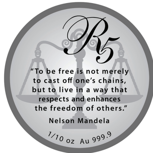
Reverse: R5 (1/10oz, Au 999.9)