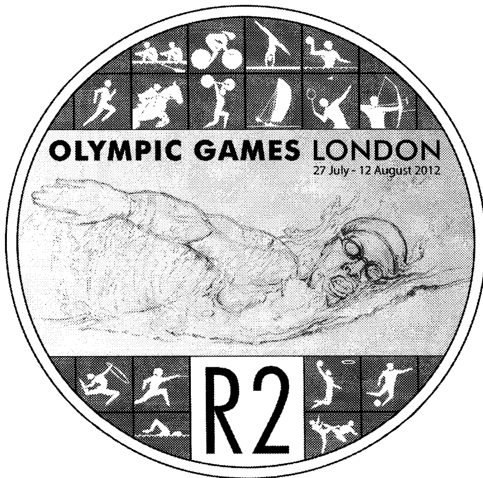
Reverse - R2 Crown Sterling Silver Coin