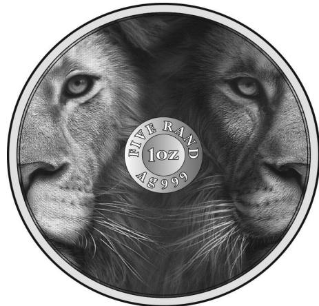
Reverse: R5 (1oz, Ag 999)