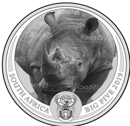
Obverse: : R5 (1oz, Ag 999)