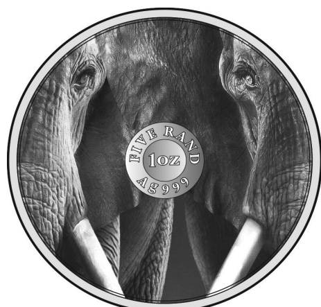
Reverse: R5 (1oz, Ag 999)