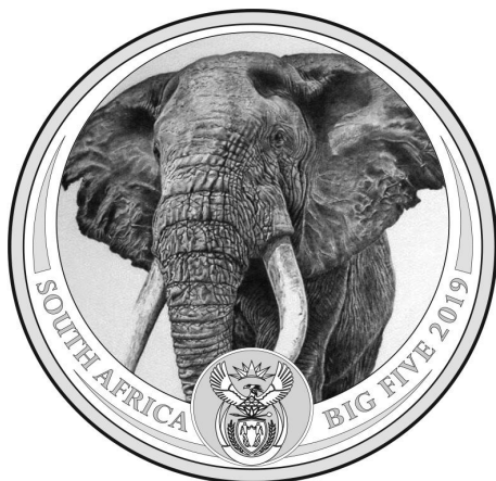
Obverse: : R5 (1oz, Ag 999)