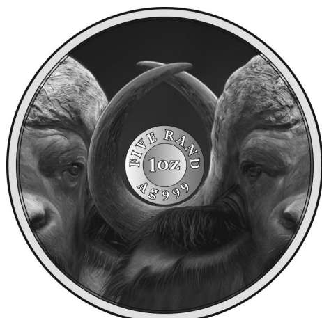
Reverse: R5 (1oz, Ag 999)