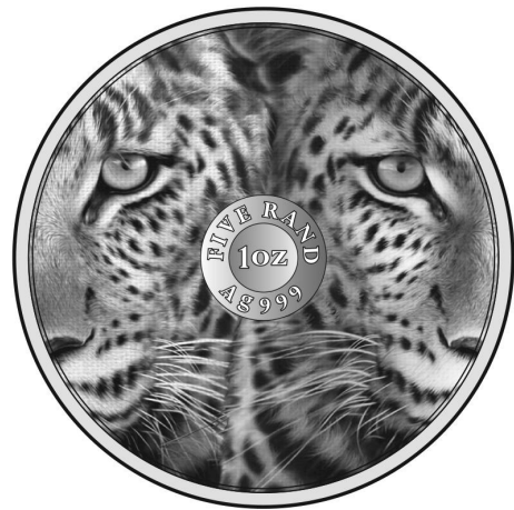
Reverse: R5 (1oz, Ag 999)