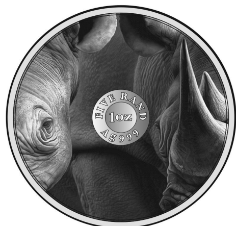
Reverse: R5 (1oz, Ag 999)