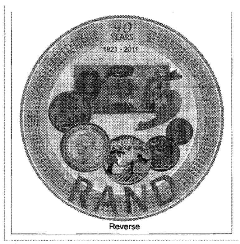
SARB 90 Years R5 Bi-Color Sterling Silver Crown Size Coin

Printed by and obtainable from the Government Printer, Bosman Street, Private Bag X85, Pretoria, 0001 Publications: Tel: (012) 334-4508, 334-4509, 334-4510