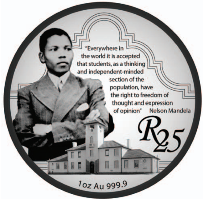
Reverse: R25 (1oz, Au 999.9)