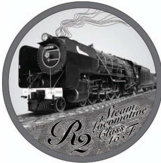
Reverse: R2 Crown (Ag 925 Cu 75)