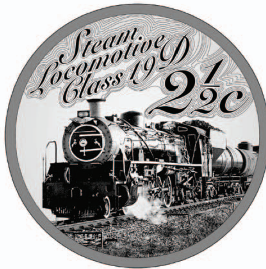
Reverse: 2 1/2 c Tickey (Ag 925 Cu 75)