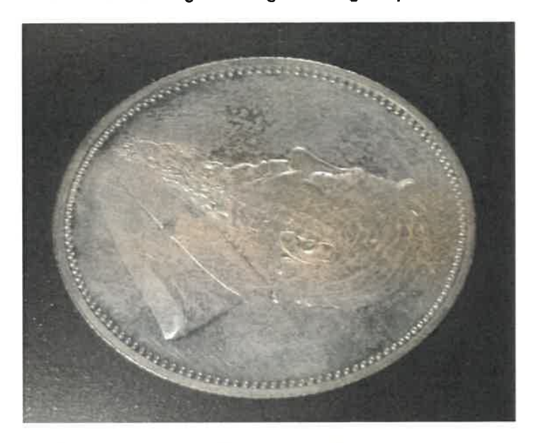
1892 Kruger Sixpence Obverse and Reverse