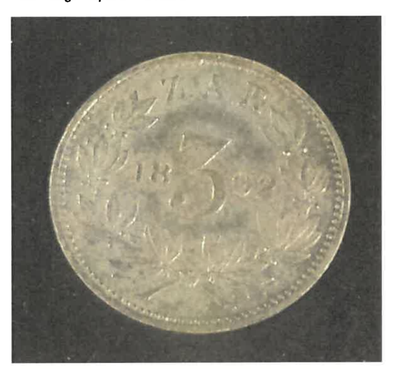
1892 Kruger 3 pence Reverse