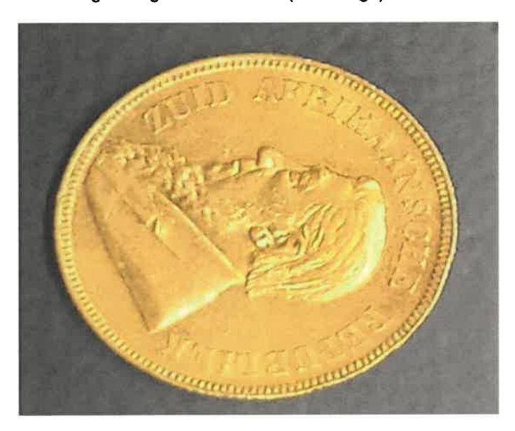
1892 Kruger Single Shaft Crown (5 shillings) Reverse