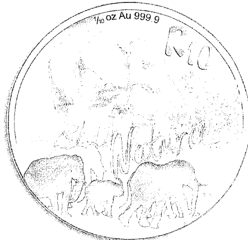
Reverse - R10 (1/10 oz) Natura