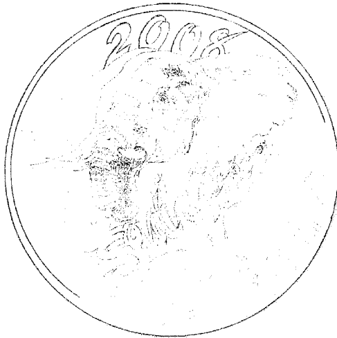
Obverse - Natura Series