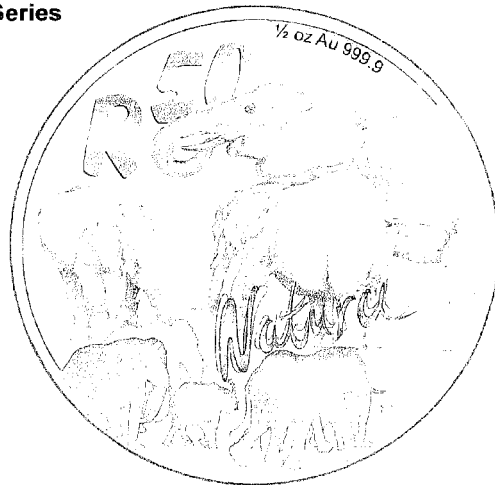
Reverse - R50 (1/2 oz) Natura