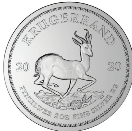
Reverse: R2 (2oz, Ag 999)