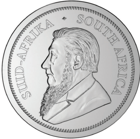
Obverse: R2 (2oz, Ag 999)