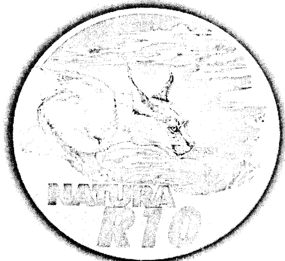
Reverse - R10 (1/10 oz) Natura Coin