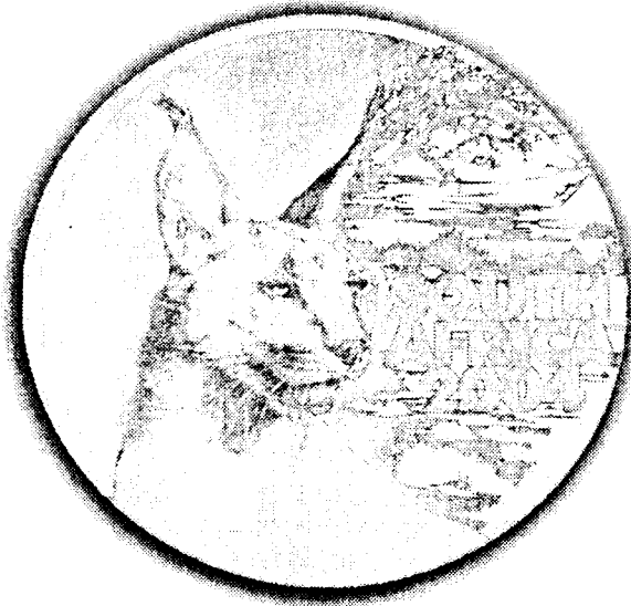
Obverse - Natura Coin Series