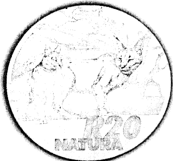
Reverse - R20 (1/4 oz) Natura Coin