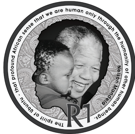
Reverse: R1 (Ag 925, Cu 75)