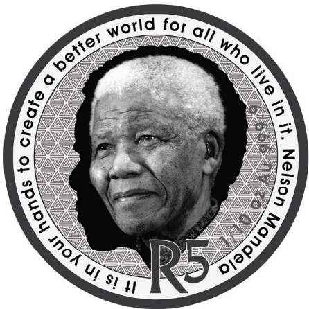
Reverse: R5 (1/10oz, Au 999.9)