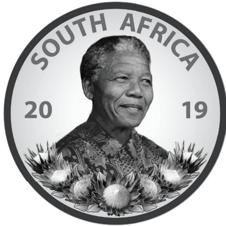
Common obverse (R25, R5 and R1)