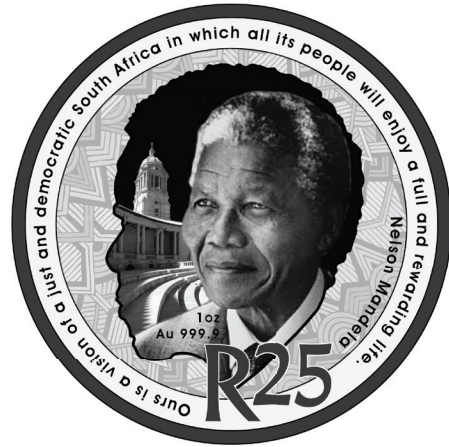
Reverse: R25 (1oz, Au 999.9)