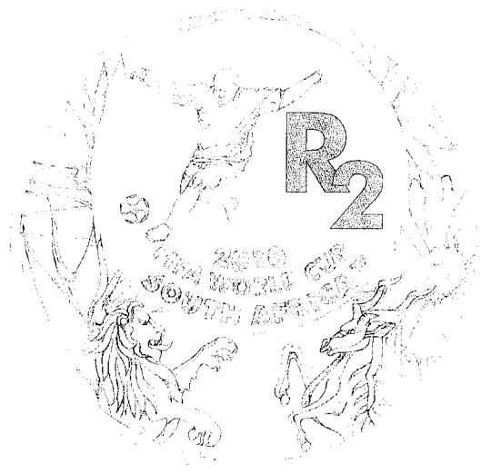
Reverse - R2 Silver FIFA Crown