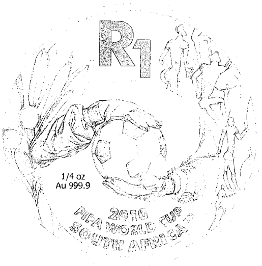
Reverse - R1 (1/10 oz) Gold FIFA Coin