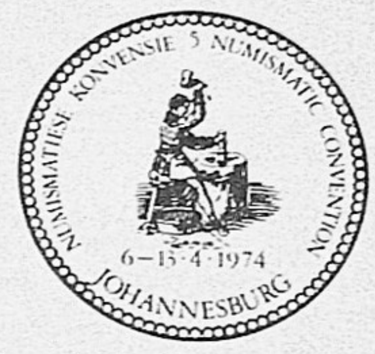
Above is the Franking Stamp which will be used at the 5th S.A. Coin Convention.

and bronze) at R100 per set will be struck in the South African Mint during March, 1974. Silver medals at R10-00 each and bronze medals at R5-00 each will be sold during the convention. These beautiful medals will bear the profile of President