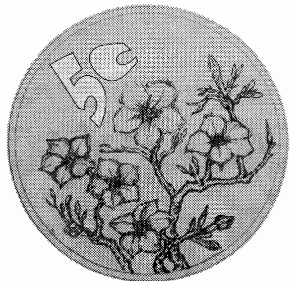
Reverse - 5c (1/4 oz) Silver Coin