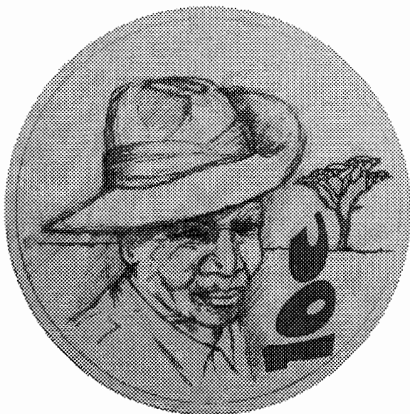
Reverse - 10c (1/2 oz) Silver Coin