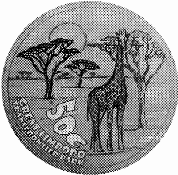
Reverse - 50c (2oz) Silver Coin