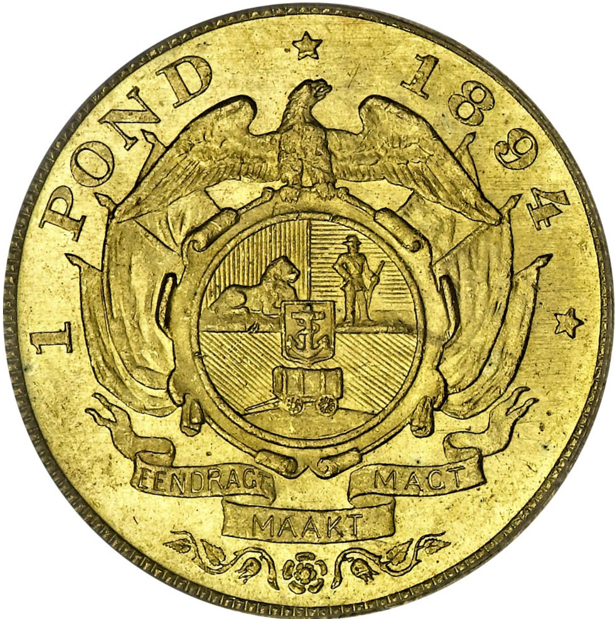
Reverse 0 – Reverse of an actual (1894) Pond for comparison