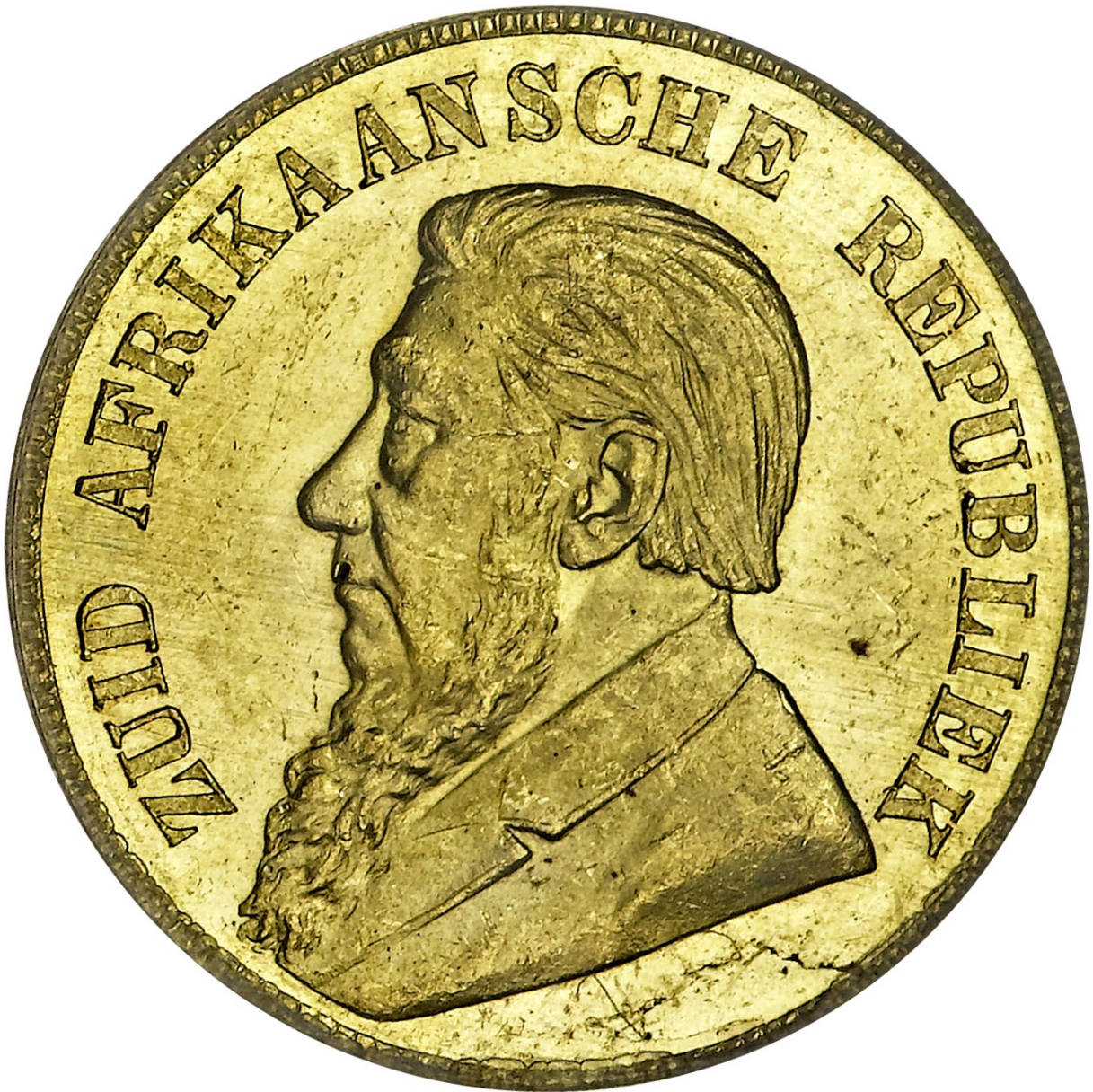
Obverse 0 – The obverse of an actual Kruger Pond for comparison