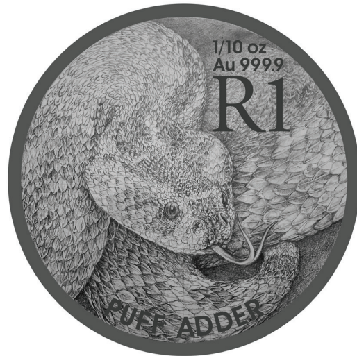
Reverse: R1 (1/10 oz) (Au 999.9)