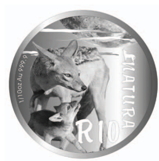
Reverse: R10 (1/10oz, Au 999.9)