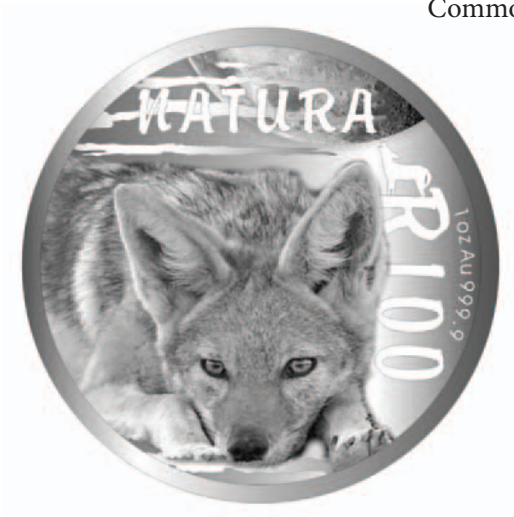
Reverse: R100 (oz, Au 999.9)