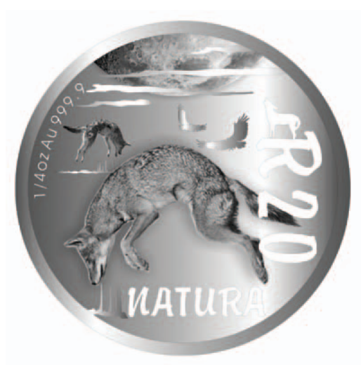
Reverse: R20 (1/4oz, Au 999.9)