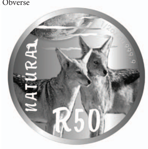
Reverse: R50 (1/2oz, Au 999.9)