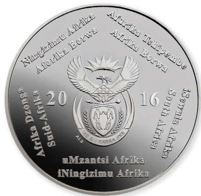
Obverse: R2 Crown (1oz, Ag 925 Cu 75)