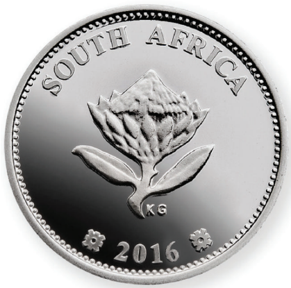
Obverse: 2 1/2 c Tickey (Ag 925 Cu 75)