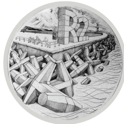
Reverse: R2 Crown (1oz, Ag 925 Cu 75)