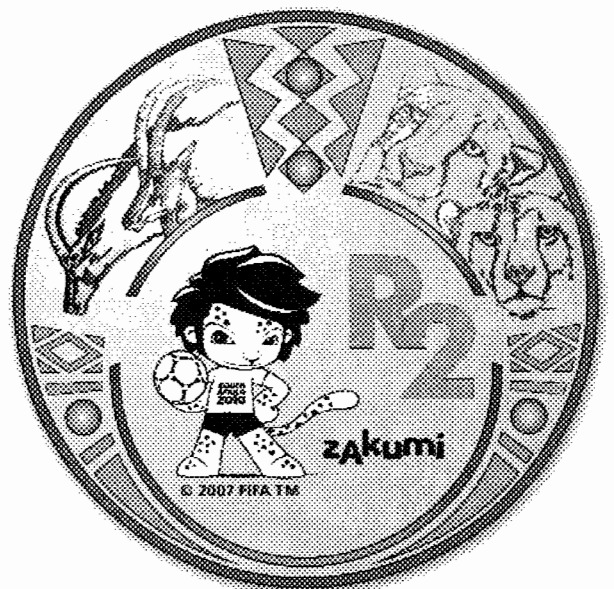
Reverse - R2 Silver FIFA Crown