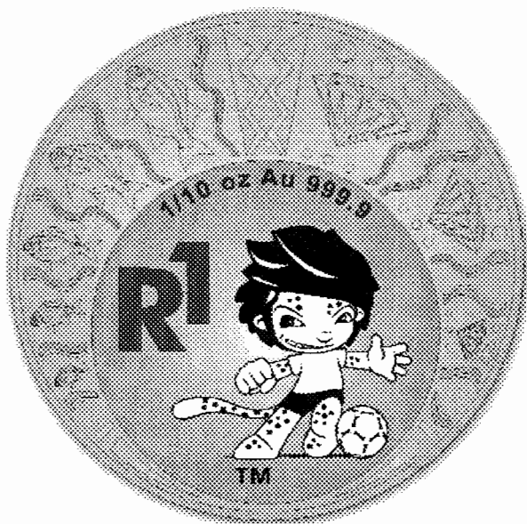
Reverse - R1 (1/10 oz) Gold FIFA Coin