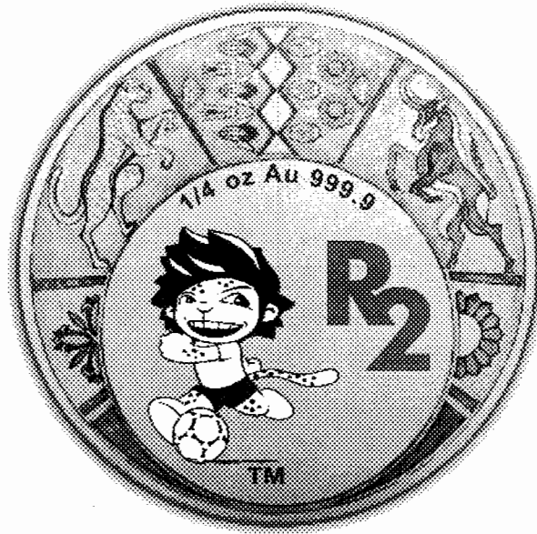
Reverse - R2 (1/4 oz) Gold FIFA Coin