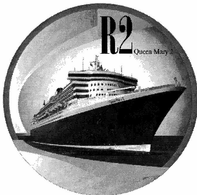
Reverse - R2 Crown Silver Coin