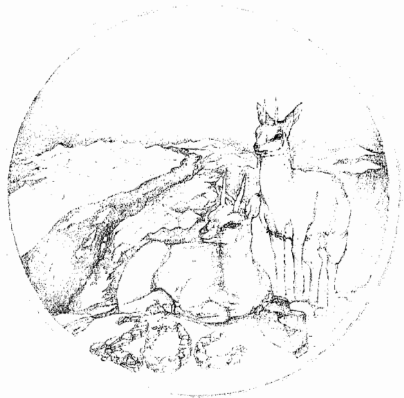
Reverse - 20c (1oz) Silver Wildlife Coin