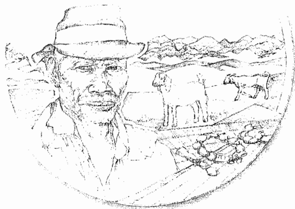
Reverse - 10c (1/2 oz) Silver Wildlife Coin