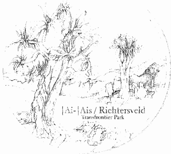
Reverse - 50c (2oz) Silver Wildlife Coin