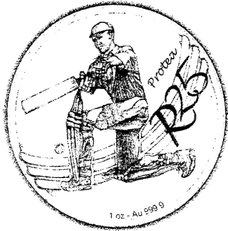
Protea 2003:1 oz Au 999.9