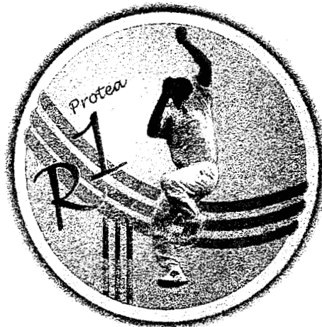
Protea 2003:R1 Silver