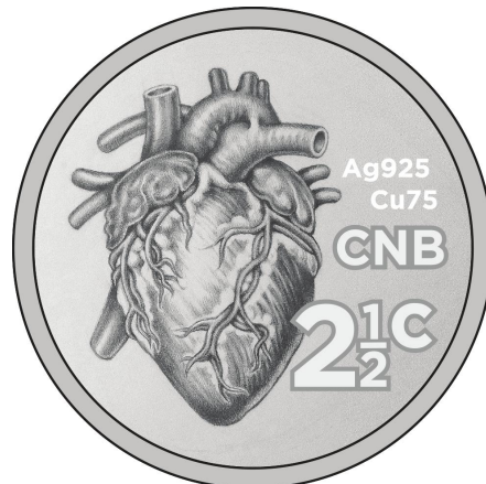
Reverse: 2 1/2 c Tickey (Ag 925 Cu 75)