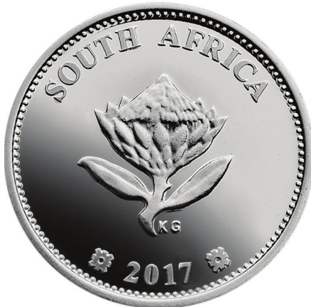
Obverse: 2 1/2 c Tickey (Ag 925 Cu 75)