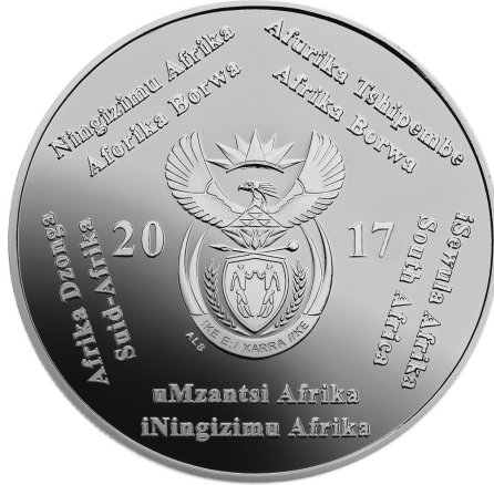
Obverse: R2 Crown (1oz, Ag 925 Cu 75)