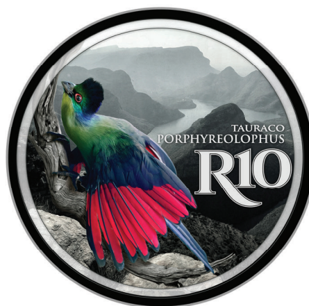
Reverse: R10 (1oz, Ag 925 Cu 75)