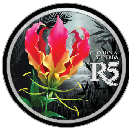
Reverse: R5 (1oz, Ag 925 Cu 75)