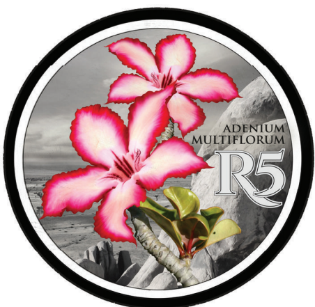
Reverse: R5 (1oz, Ag 925 Cu 75)