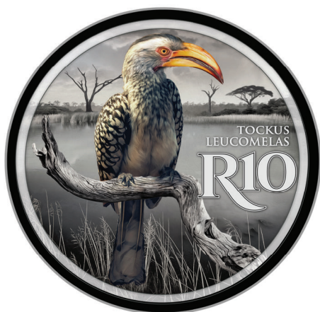
Reverse: R10 (1oz, Ag 925 Cu 75)