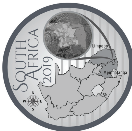
Common obverse (2x R5 1oz, and 2x R10 1oz)