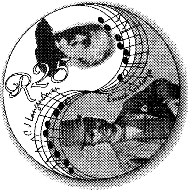
Reverse - R25 (1 oz) Gold Protea Coin