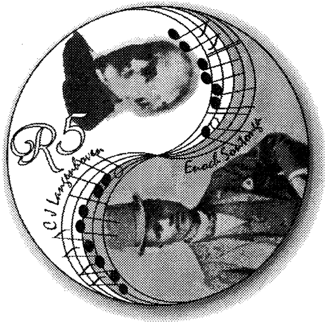
Reverse - R5 (1/10 oz) Gold Protea Coin